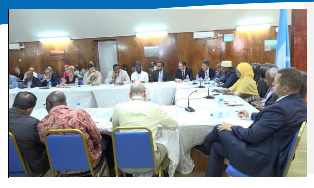
Emergency coordination meeting on covid-19 in Mogadishu.

Source http://fts.unocha.org, 27 March 2020