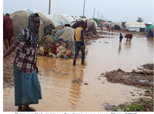
Rains are likely to trigger flooding in some areas.

three days with many stations recording rainfall between 20 mm and 50 mm. On 26 March, the Humanitarian Affairs and Disaster Management Agency (HADMA) in Puntland reported that storms damaged at least 10 houses in Shaxda village near Qardho; floods have also cut off the main Garowe- Bossaso highway near Qardho, temporarily disrupting traffic. Local authorities in Qandala said livestock were killed.