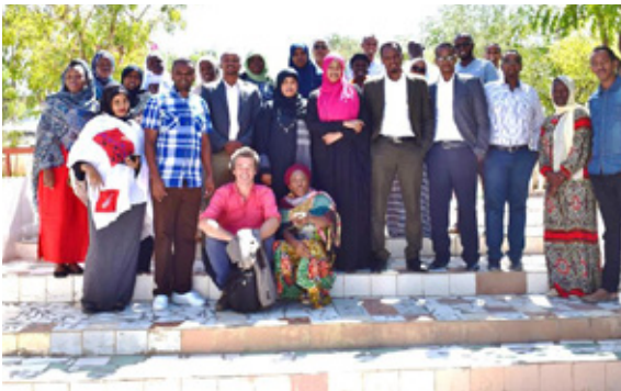
▲ GBV Mainstreaming Training & Engagement with Religious Leaders.

and cosmetic renovation of lab building, the lab is expected to start function by end of March.