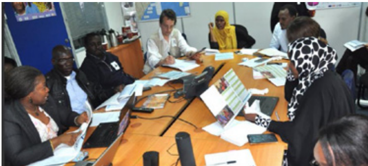
▲ National GBV Sub Cluster Coordination meeting of 25th Apr 2016 in Nairobi. Photo: UNFPA, Apr 2016.