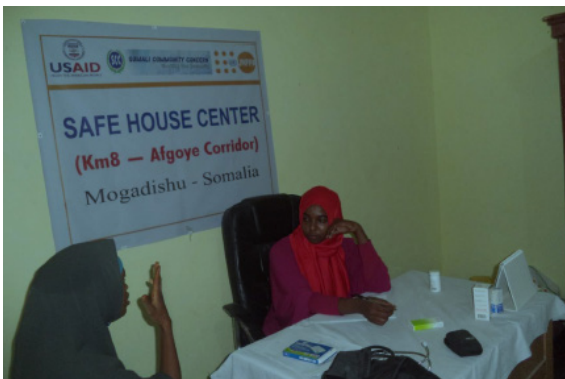
▲ GBV Service Provision in UNFPA-supported Safe House in Afgoye. Photo: SCC: 2016.