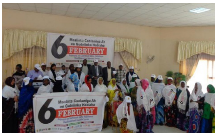
▶ International Day for Zero Tolerance to FGM Celebration in Hargeisa.