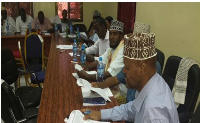
▲ Religious leaders during the workshop in Garowe. Photo: UNFPA, Dec 2016.