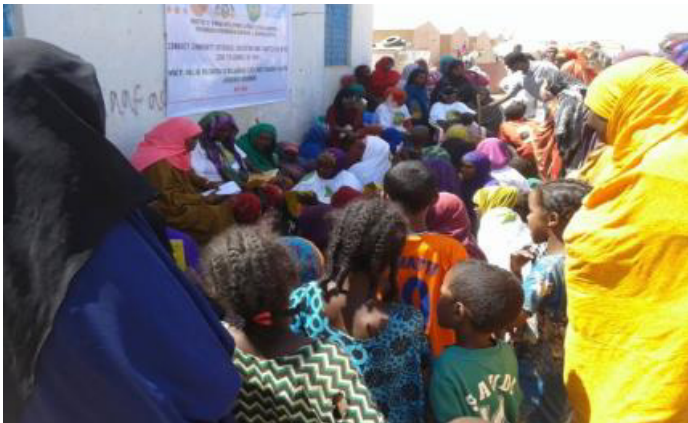
▲ Community Declaration gathering in Puntland.