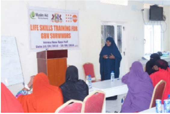
▲ Life skills training for GBV Survivors. Photo: Muslim Aid. 2016.