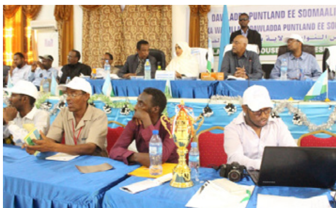
▶ IWD Celebration in Garowe. Mar 2016.