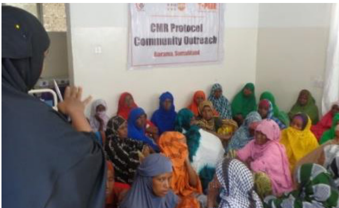
▲ Community Engagement on the CMR Protocol.