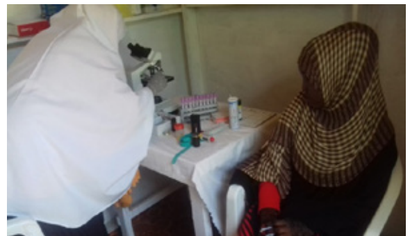
▶ GBV service provision at one of the Family Centres funded by OFDA/USAID through UNFPA in Mogadishu. Photo: HINNA: 2016.

dignity kits dispensed to GBV survivors.