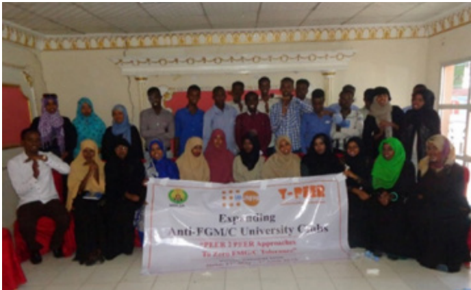
▲ One of the FGM Clubs in Somaliland.