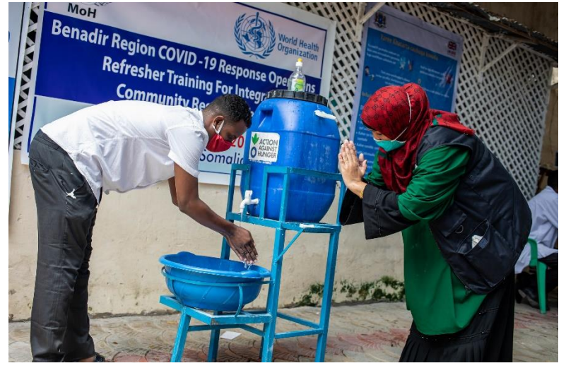
Community health workers being trained on handwashing.

The Federal Ministry of Health in partnership with WhatsApp and Infobid have launched a free coronavirus information service. Users can access the service by adding the number +252613600700 to their phones or by clicking on htps://bit.ly/MoHSomalia. Across the country, radio spots highlighting COVID-19 prevention measures have been aired on 21 radio stations, reaching an estimated 10 million people, according to