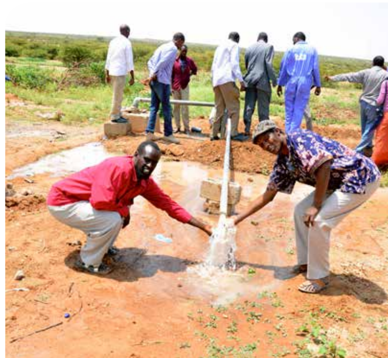
Wajaale town is now connected to a borehole in Bator some 20 kilometres away

The water company is called Caafi, a Somali word meaning "good health." Shares in the company can be purchased by the private sector and it is expected to reinvest some of the profits from the expansion of the water supply, install the distribution network, construct its own offices and support the Water Users' Association.