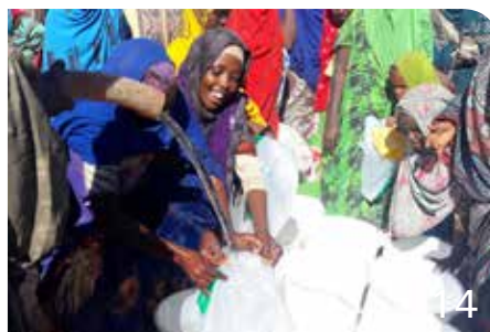
Water, Sanitation and Hygiene (WASH)