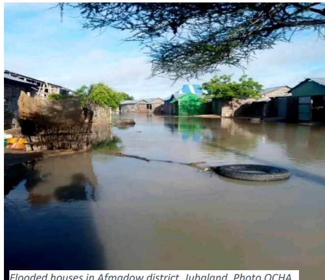
Flooded houses in Afmadow district, Jubaland.

Hirshabelle State: The risk of floods in Belet Weyne is very high. According to SWALIM, following heavy rains within the Shabelle River basin in Ethiopia and inside Somalia, the river level at Belet Weyne rose to 7.20m - just 0.10m less than the high-risk flood level on 4 May. At the same time flooding in Qalafe and Mustaxil, about 90 km north of Belet Weyne, is likely to result in overflowing of the river at Belet Weyne in a few days. On 30 April, a river breakage was reported in Tuugaarey village, 25 km from Jowhar town, flooding Tuugaarey and Maagaay villages. An estimated 700 people were displaced in Tuugaarey. Over 300 hectares of crops were reportedly destroyed in both villages. Heavy rains have also been reported in many parts of Middle Shabelle region, posing a risk of flash and river floods in Jowhar, Mahaday and Balcad districts in the coming days